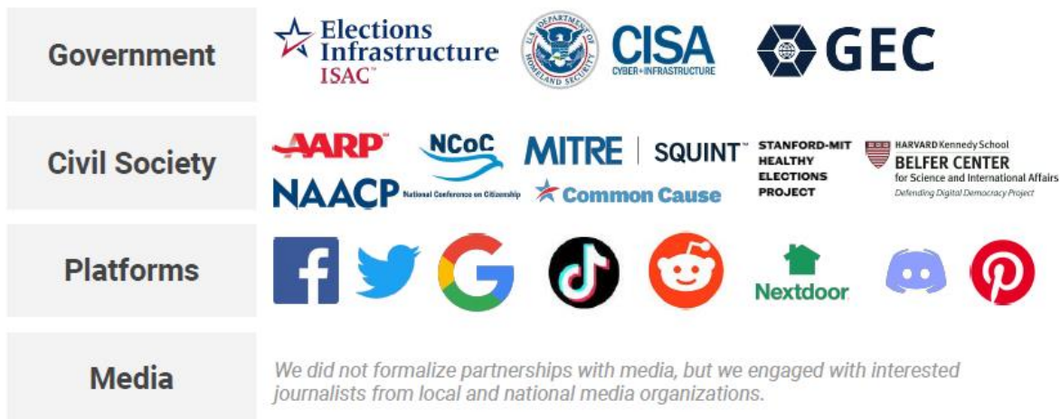
Figure 1EIP Report- The Long Fuse: Misinformation and the 2020 Election

The EIP featured four different groups of stakeholders under the direction of officials in the federal government.